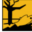
Dangerous for the environment